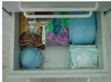
(Fig. 7 – 10)